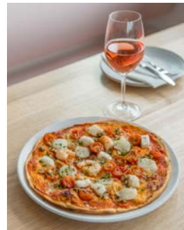
TOP TO BOTTOM: The outlook at SeaSalt, Beach Bum's fusion fare, pizzas are a calling card at Melt.

The views here – over the seemingly endless Gulf St Vincent – reign supreme